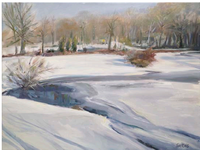
Icy Winter Lake 18" x 24" Oil on Canvas

This painting encompasses everything I love about the winter. The snow, ice and water come together to create an interesting and dynamic composition. Many of you may recognize the red building as The Saddle River Inn. It provided me with a great day painting and many others with an exceptional dinner. It is on view at the Columbia Frame Shop in Glen Rock, NJ.