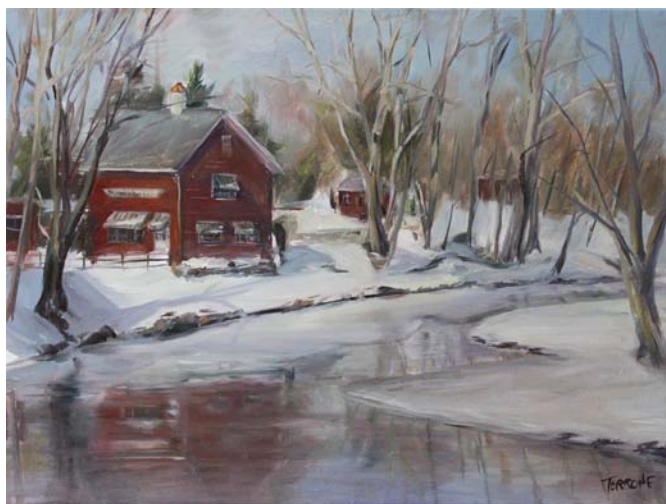
The Inn 18" X 24" Oil on Canvas

Winter Woods talks to me about aging. The young tree just starting out. The older tree strongly rooted yet brittle and hurting, and the remains of the tree that has since left us but leaves something behind .