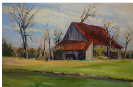
The Red Barn

Signed, framed and matted in 16" X 20" silver frame. Available for $250.00 each