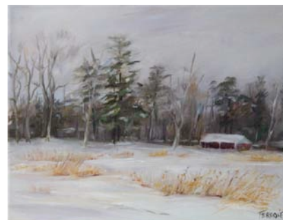
By the Lake 11X14, Oil on Canvas

I will concede that I don't particularly like freezing, but it is a small price to pay, wouldn't you say?