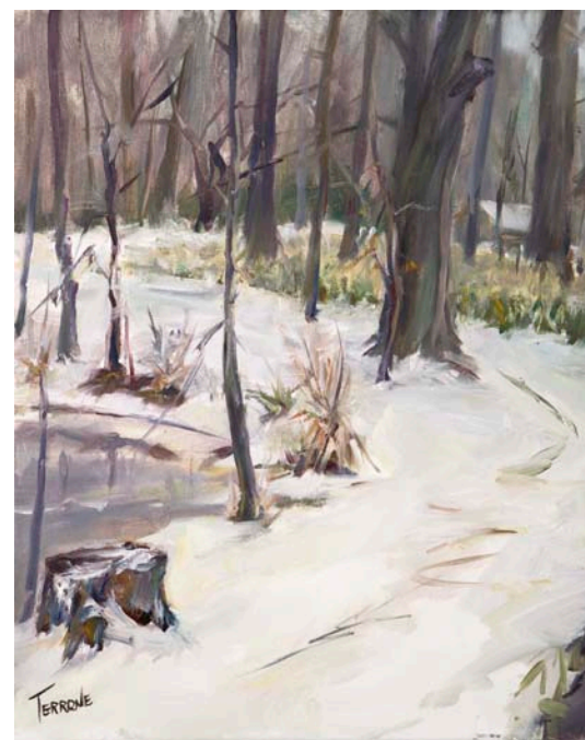
Winter Woods 16" x 20" Oil on Panel

Winter Woods talks to me about aging. The young tree just starting out. The older tree strongly rooted yet brittle and hurting, and the remains of the tree that has since left us but leaves something behind .